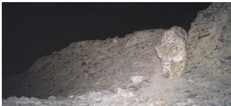
FIGURE 1 Snow leopard photo captured at the Khunjerab National Park, Pakistan.

creatures is decreasing due to factors such as poaching, retaliation, and habitat damage; their numbers range from 2,710 to 3,386 (Li et al., 2020), and climate change (Alexander et al., 2015). The annual poaching of snow leopards has ranged from 221 to 450 instances, or around 4 per week, since 2008. Over 90% of these occurrences take place in only five countries: Pakistan, China, India, Mongolia, and Tajikistan (Din et al., 2022).